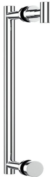
Single Door Handle with Knob shown with a medium Rosette